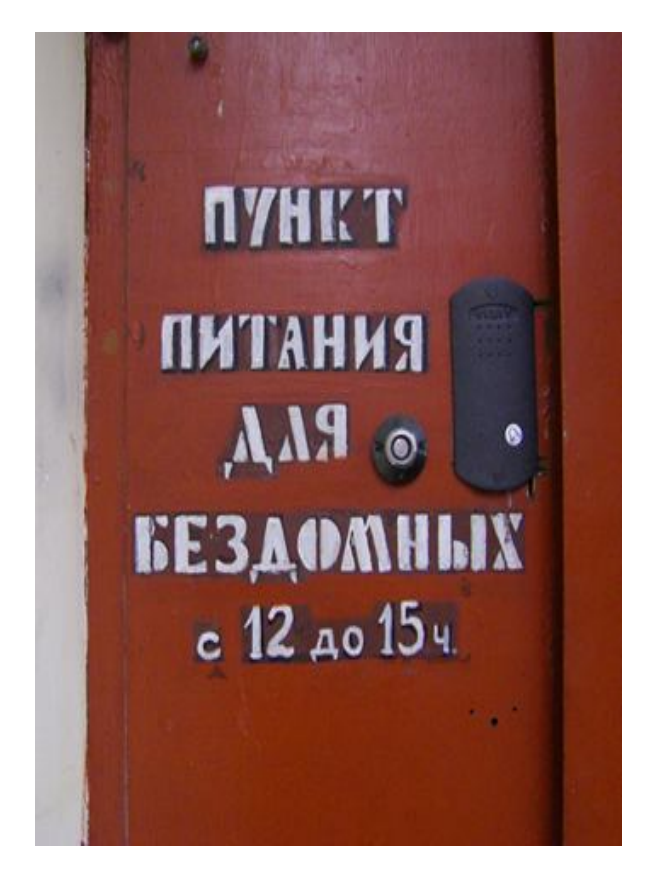
The entrance to Caritas' Canteen. The text on the door says Meal Station for Homeless. From 12 to 15 hours , and was the only sign indicating the existence of the place.

interview with a homeless woman. This research is therefore exclusively about homeless men. For research on homeless women see e.g. Beigulenko 1999.