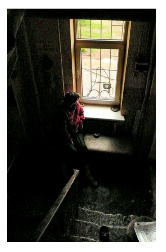
The staircase bench at Nochlezhka, where residents sat smoking. I spent many hours here, talking and observing. Several informants were recruited for interviews here.